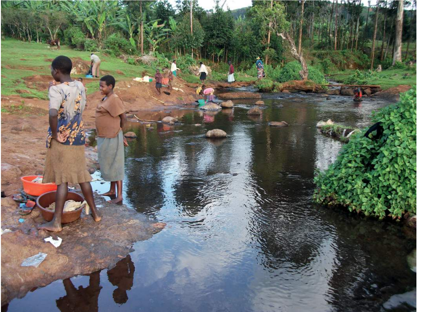
Photograph A for Question 4