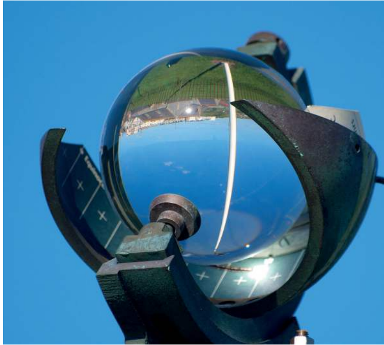
Photograph B for Question 7